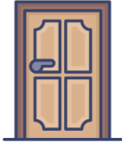
(la) puerta de entrada